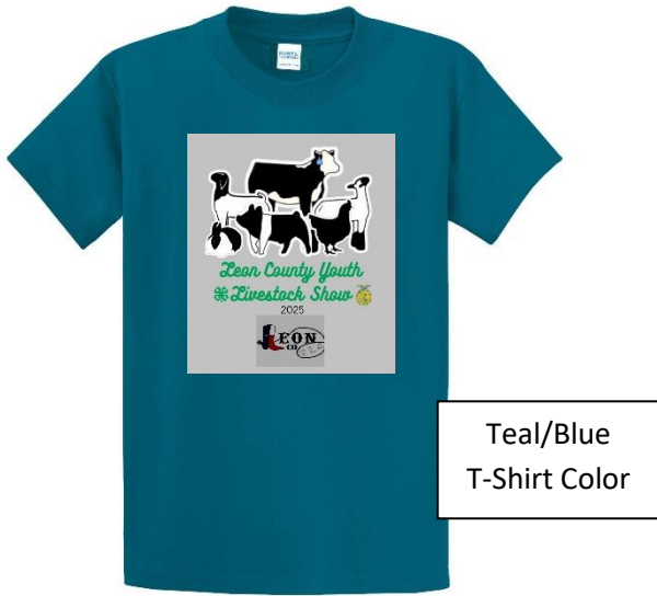
Teal/Blue T-Shirt Color