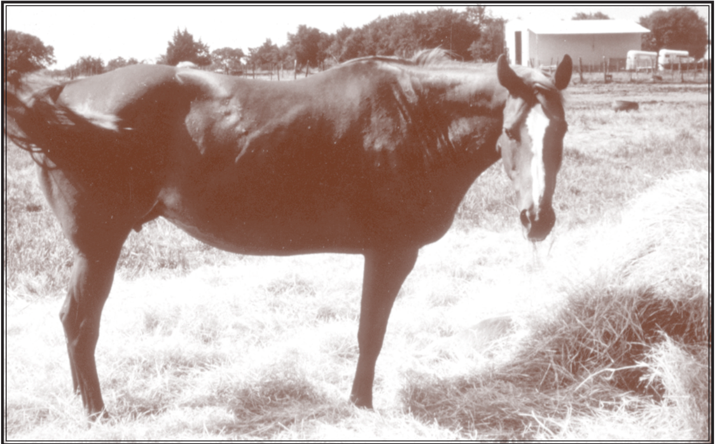
Round bales can be fed to horses if the hay is high quality. Expect some wastage due to weather and scattering.

Protein content of sun-cured red clover hay is intermediate between grasses and alfalfa, and energy level is about the same as many grasses, while its levels and ratios of both calcium and phosphorus are similar to that of alfalfa. Red clover hay often appears stemmy, and it does not possess the bright green color of other legumes. Limited studies indicate that horses are less susceptible than other livestock to problems caused by eating clover, such as slobbering. However, horses can be affected by dicoumarin present in moldy or improperly cured sweet clover.