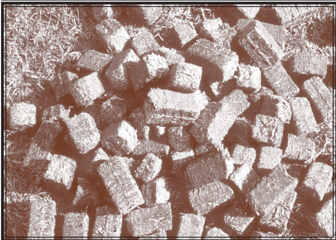
Alfalfa cubes are one feedstuff that can be used to supplement horses on poor or limited pasture.