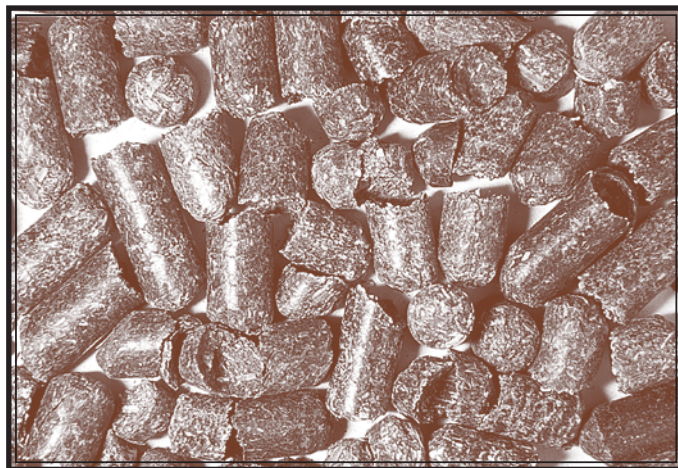
Alfalfa pellets vary in size and usually have a guaranteed nutrient content.

Feeding trials using 25 percent alfalfa in a pelleted-grain-mix have shown pellet density to be more important than pellet size. 17 For example, hard, crunchy pellets are consumed more slowly than soft, crumbly pellets. Horse owners should know the exact weight of pellets fed instead of relying on coffee-can