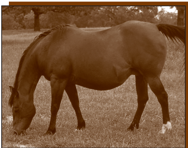
Broodmares should be fat, but not obese in body condition of 6-1/2 to 7.

Texas is home to some of the best broodmares in the country, but many owners worry about their mares 15 years old and older. Research including groups of older mares has focused on conception and foaling rates, in which body condition plays a significant role regardless of age. 13 Contrary to popular belief, fat mares have not experienced foaling problems (dystocia). 14 A group of older mares with no breeding-problem history should have conception rates of 95 percent or higher, provided they are in good body condition.