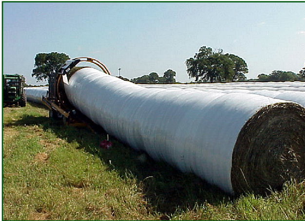
Figure 8. Multiple high moisture “haylage” bales being wrapped in plastic.

Haylage involves baling forage with 45 to 55 percent moisture content, then putting the bales into airtight storage. Haylage is typically wrapped in plastic to exclude air. Aerobic (free oxygen requiring) bacteria then consume the oxygen remaining inside the hay within a few hours. Under these conditions, anaerobic (non-free oxygen requiring) bacteria reduce the forage pH and preserve the forage in a more or less “pickled” state. The low pH inhibits mold and respiration losses that typically occur in high-moisture bales. Haylage does not, however, attain as low a pH as silage so it cannot be stored as long. The cost to wrap long strings of round bales (Fig. 8) or individual bales (Fig. 9) is about $5 to $7 per bale. While haylage reduces leaf shatter loss and allows you to preserve high-moisture forage, it is typically fed on-farm because it cannot be moved easily.