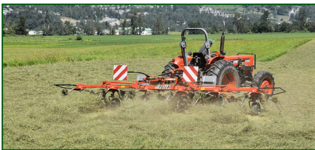
Figure 6. Tedder used for inverting dried forage to speed drying.