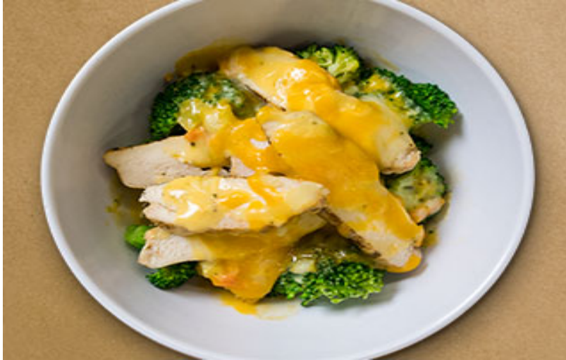
Kids Chicken & Broccoli Bowl with a bottle of water